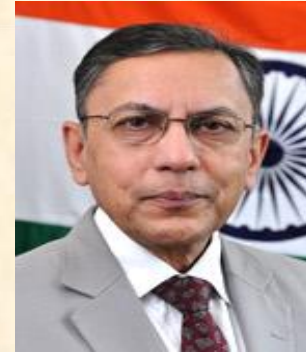
Ambassador Ranjit Rae Former Ambassador of India to Nepal.